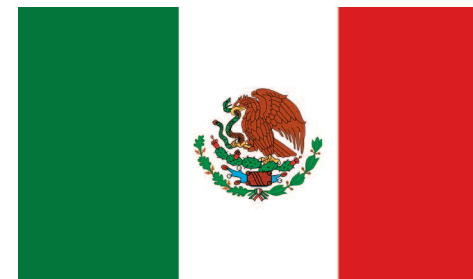
Mexico's National Flag

The fifth of May is when Americans celebrate an important battle in Mexican history with so much food and music and fun that the real story behind the holiday is often overlooked. While Cinco de Mayo is often thought of as a celebration of Mexican independence, it is not.